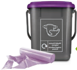
Black caddy with purple lid and single-use purple sacks