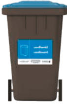
Black bin with blue sticker