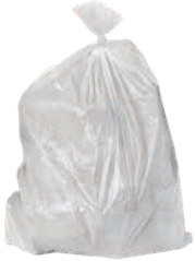
Single-use white sack