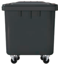
Black bin with black lid