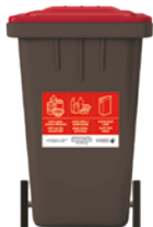
Black bin with red sticker