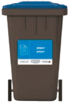
Black bin with dark blue sticker