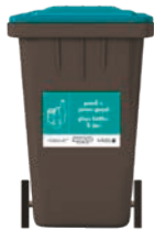
Black bin with turquoise sticker